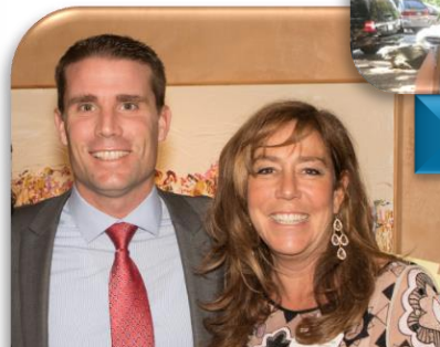
Senator Mike McGuire