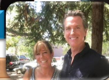
Governor Gavin Newsom